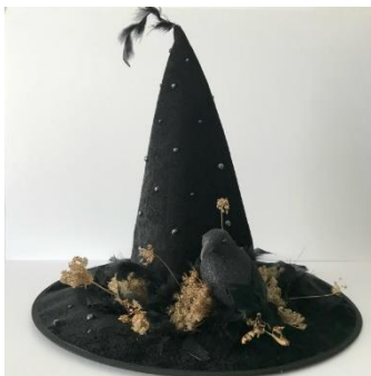
Raven Steeple Crown

Be sure to leave the zipper area clear of feathers. If needed, trim feathers away to avoid a zipper jam.