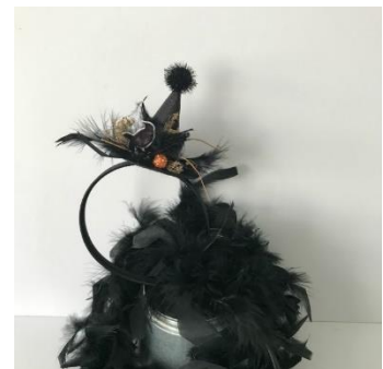
Raven Mini Crown